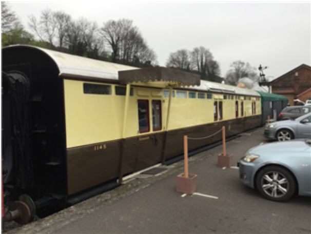
Churchward Bogie Gangway Full Brake (BG) Toplight (Diagram K36)