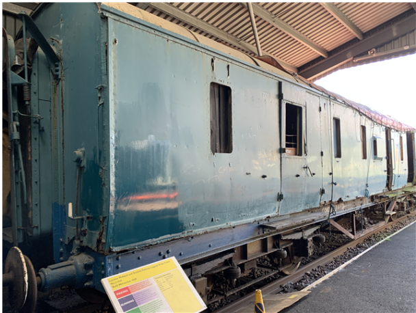
31036, Bo'ness MRG

Stanier Period 3, Bogie Gangway Full Brake (BG) Centre Side Ducket (Diagram 2007)