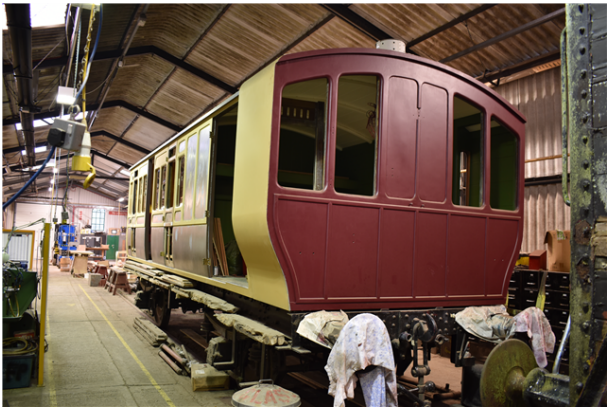
Stroudley, four-wheel suburban brake third.