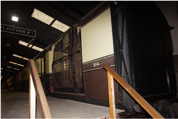
Collett Bogie Postal Stowage Van (TPO) Travelling Post Office (Diagram L23)