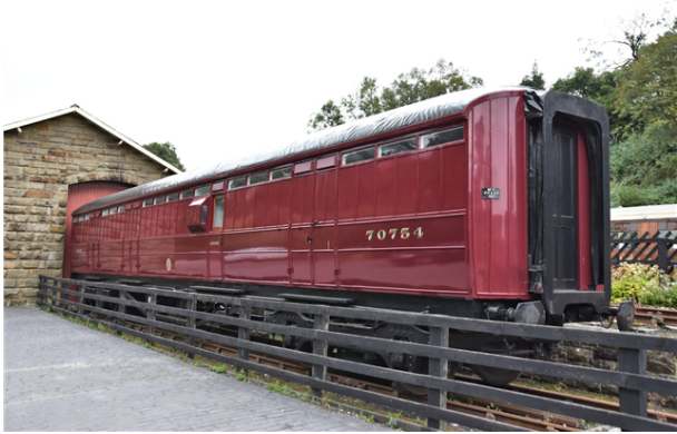
Gresley Bogie Gangway Full Brake (BGP) Pigeon Van (Diagram 245)