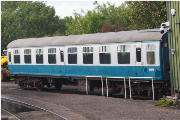
4809 at North Weald