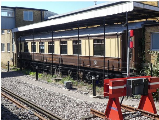
92 'Malaga' at Shepperton