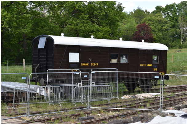
SECR design four wheel parcels Van. Original design that later became standard SR PMVY