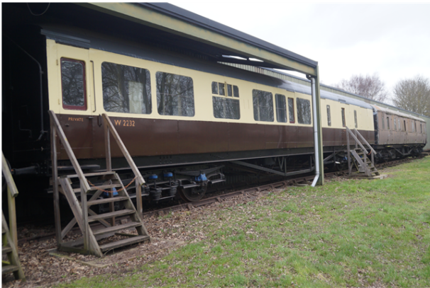
Hawksworth Bogie Corridor Brake Third (BTK) BR Built (Diagram D133)