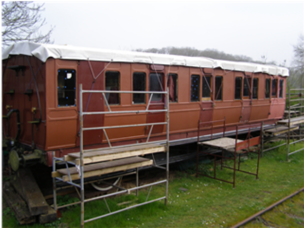
Ashbury 6w Composite (CZ) 5 Compartment (Diagram 5)