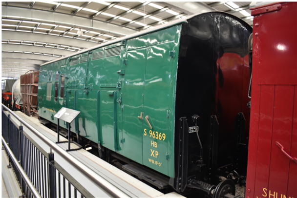
Southern Railway Special Cattle Van.