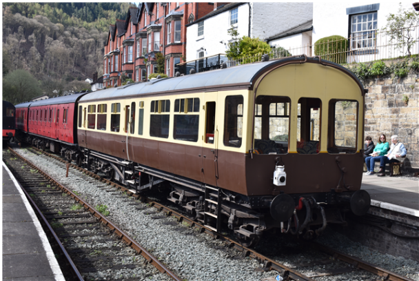
Hawthornth Bogie Inspection Saloon (INSP) BR Built (Diagram Q13)