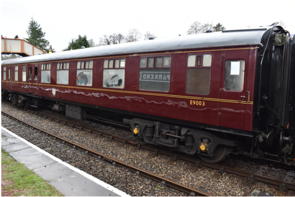
9003, Dean Forest Railway