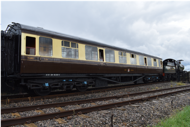
Collett Bogie Corridor Third (TK) Standard Stock (Diagram C77)