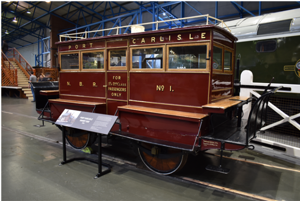
Port Carlisle Dandy Car