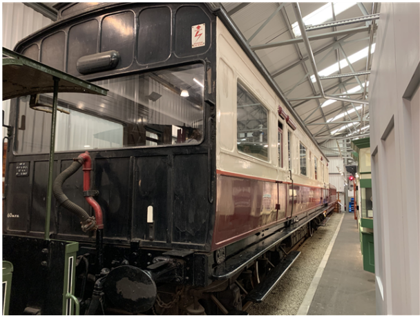
Clerestory Directors' / Royal Saloon