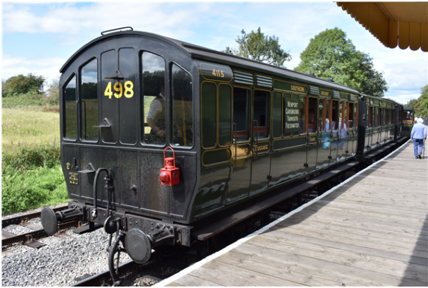
Billinton four-wheel brake