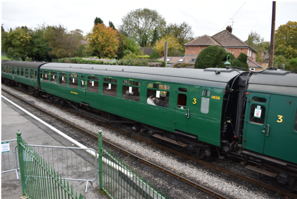
1456 on MidHants