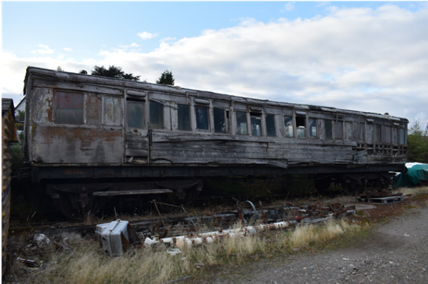
North British Railway, non-corridor, lavatory third