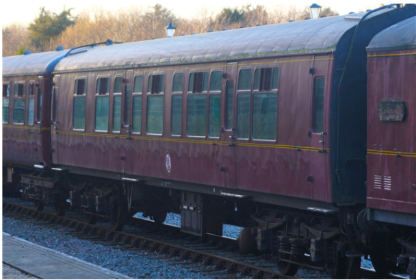
16168 at Ruddington Fields 22/2/2025 Dan Cardwell