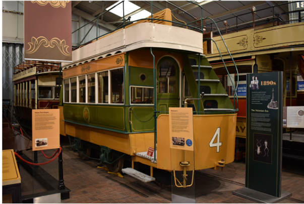
Blackpool Tramway no 4 was built for Britains first electric tramway, opening in 1885