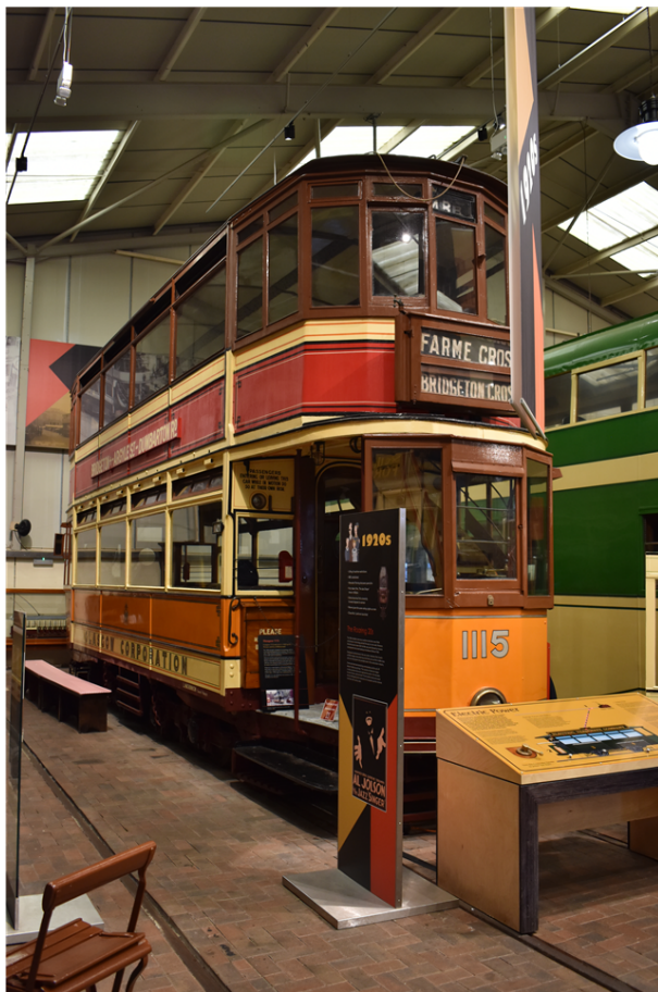
1115, Crich, June 2024