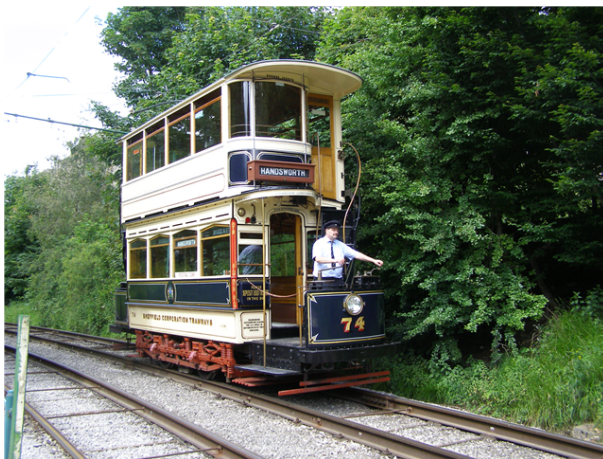
Double deck, enclosed tram