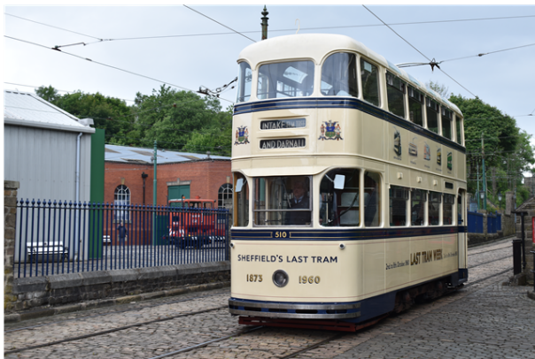
No 510, June 2024