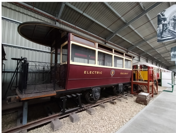
Single deck electric tram for Ryde Pier