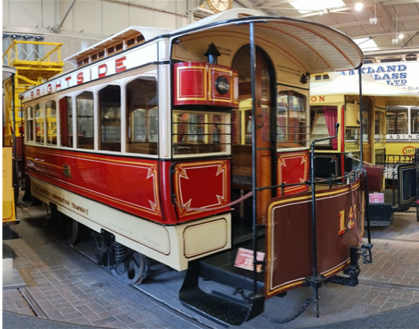
Single deck, horse drawn tram car