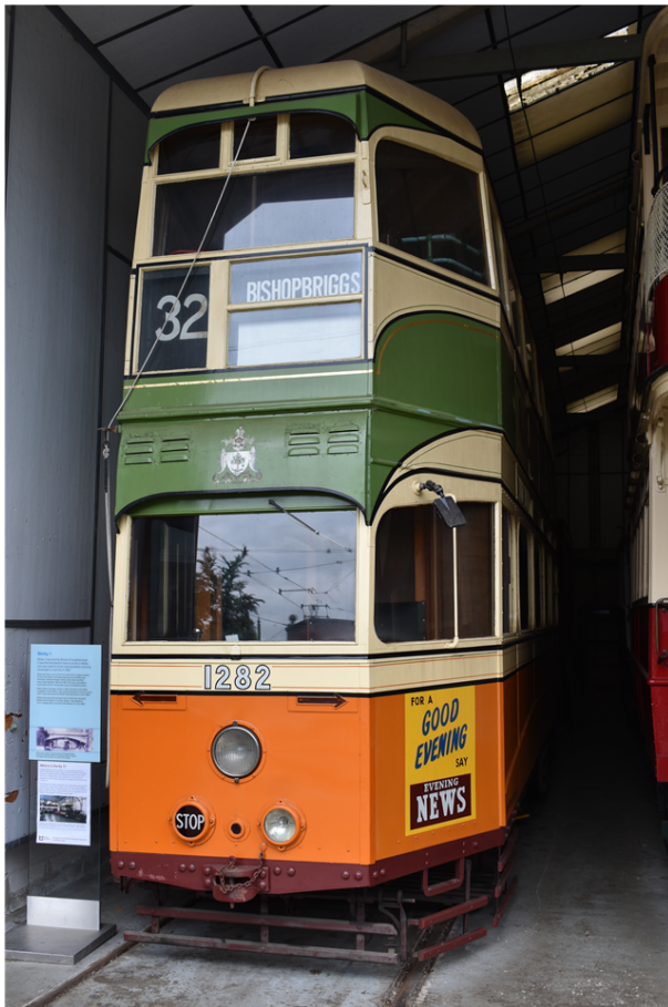
1282, Crich, June 2024