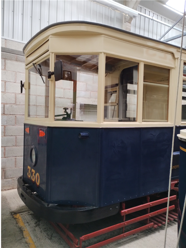
Former Bradford Corporation tram, converted as works water car / carborundum car.