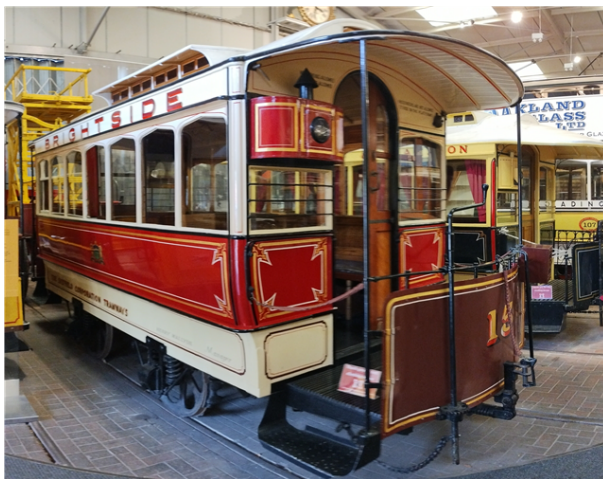
Single deck, horse drawn tram car