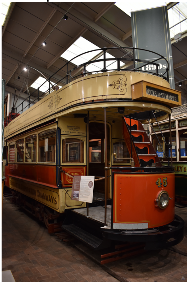
No 45, Crich, 2024