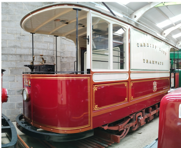
131, Crich, June 2024