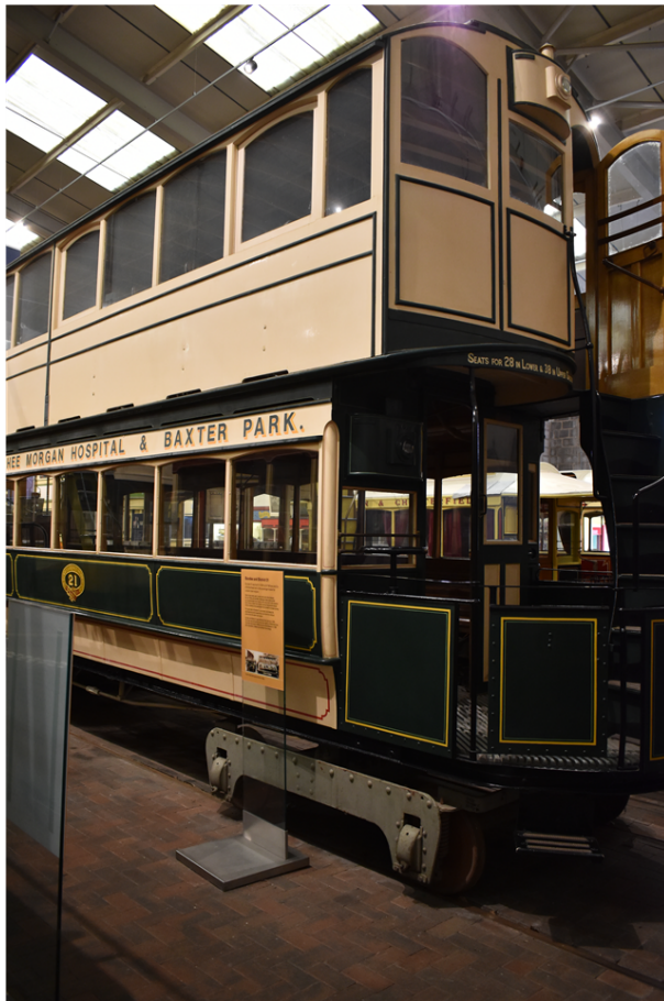
No 21, Crich, 2024