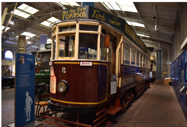
No 5, Crich, June 2024