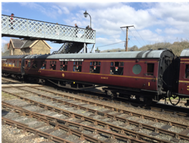
Stanier Bogie Corridor Composite (CK) Period 3 Porthole, BR Built (Diagram D2159)