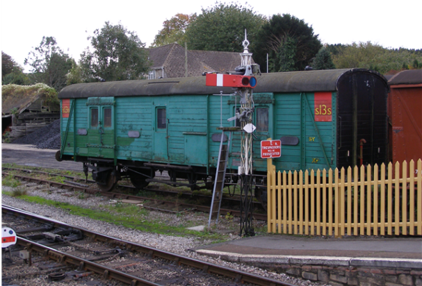
SR 13 Van C (BY) Guard/luggage Four wheel van