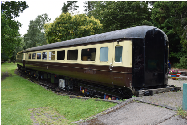
Tintern Station, July 2020