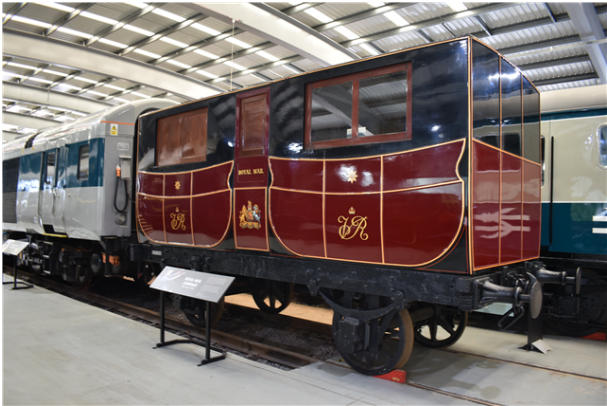
Replica TPO, built 1838 for centenary of travelling post offices.