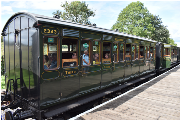
2343, Smallbrook Jct, Aug 2023