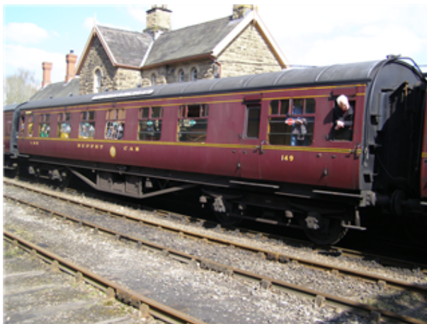
Stanier Bogie Open Third (TO) Period 3 (Diagram D1915)