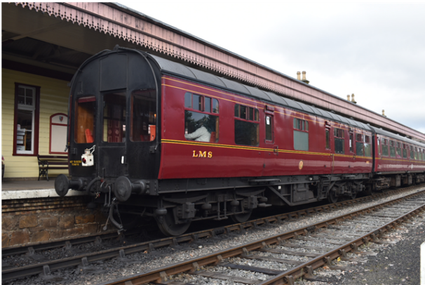
45201, Aviemore, Sept 2022