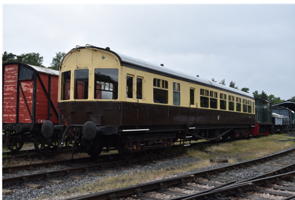
Hawksworth Autotrailer Third (DTT) BR Built Bow End (Diagram A38)