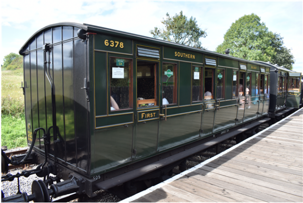
6378, Smallbrook Jct, Aug 2023