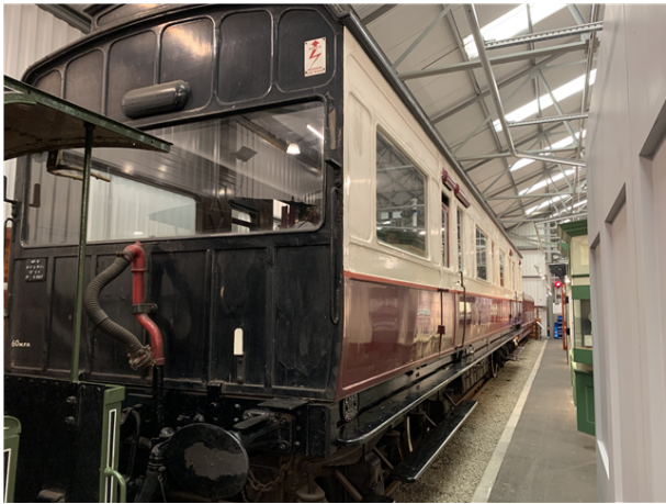
Clerestory Directors' / Royal Saloon