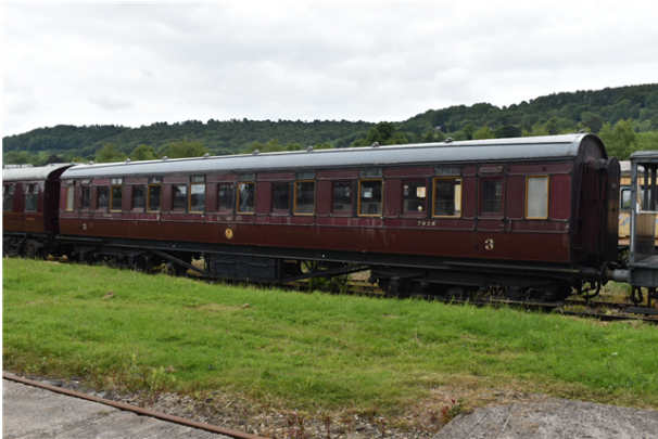
7828, Peak Rail, June 2024