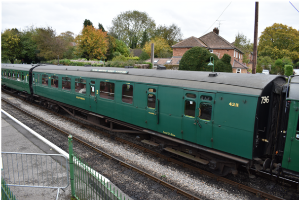
BTK 4211 at Medstead and Four Marks