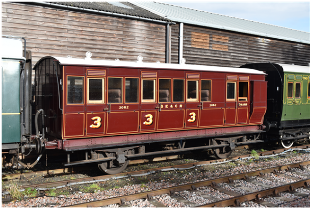
LCDR Brake Second. Body only, now running on donor underframe.