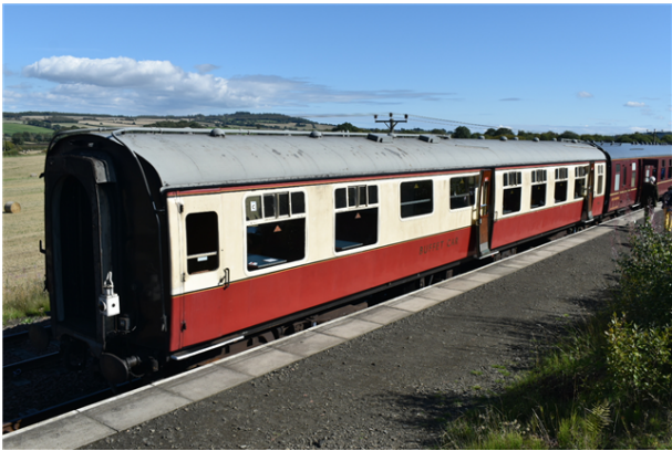
1866, Bo'ness & Kinneil Railway, 2022