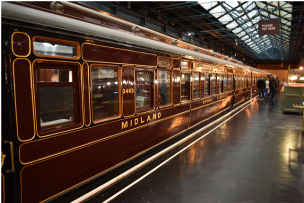
Third Dining Car