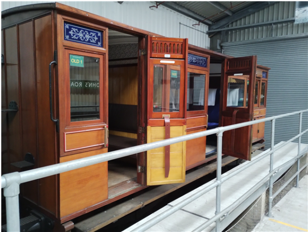
Isle of Wight Railway, four-wheel 3 compartment composite.