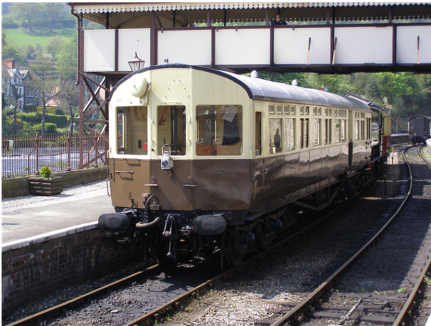
163 at Llangollen, May 2008