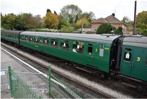
1456 on MidHants