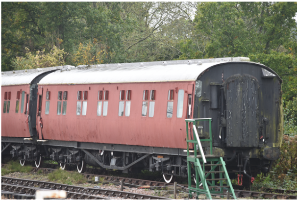
Both coaches now scrapped