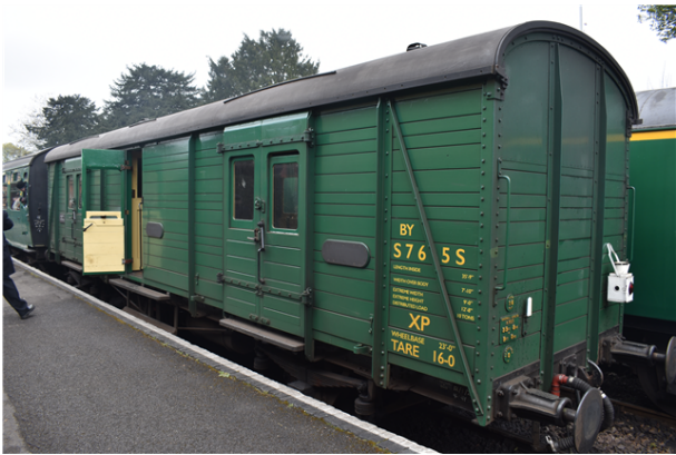
Southern Railway Van C (BY). Four wheel Guard/Luggage Van