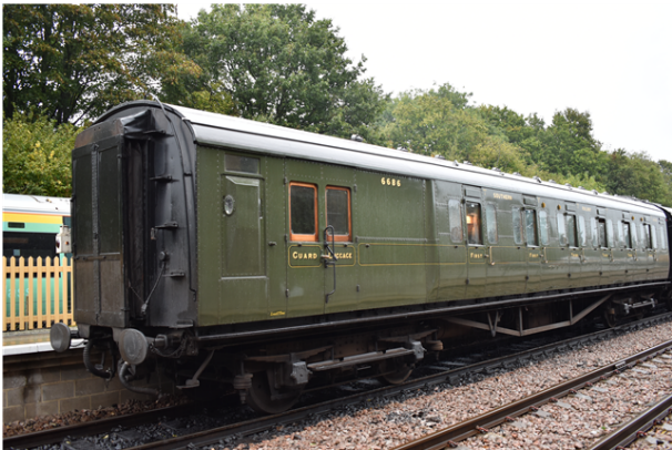
BTK No:6686 MRG