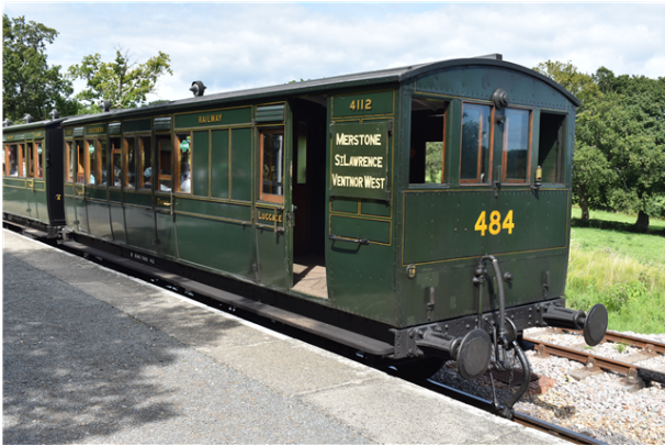
4112, August 2023