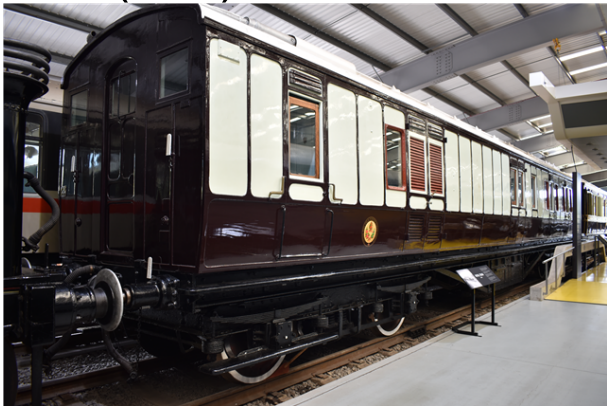
LNWR BFK, later Royal Carriage