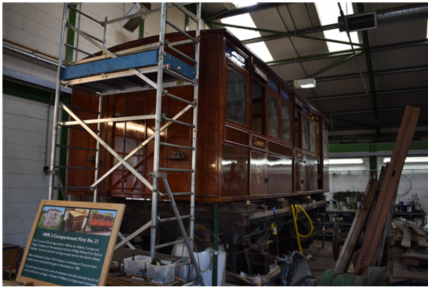
Isle of Wight Railway four wheel 3 compartment first