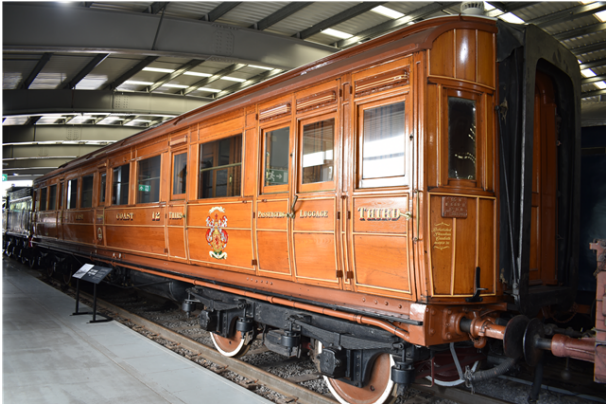
Teak construction East Coast Joint Stock Third Corridor