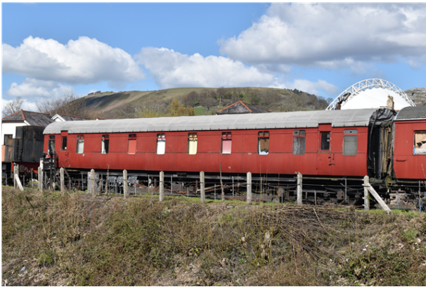
LMS period 3 sleeper