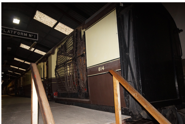
Collett Bogie Postal Stowage Van (TPO) Travelling Post Office (Diagram L23)