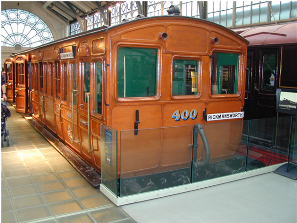
Metropolitan Railway second class compartment coach