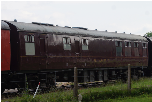
M1970 at Peak Rail Dan Cardwell