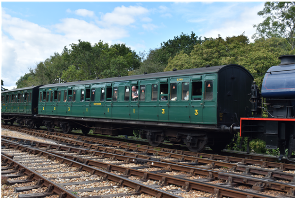
LBSCR composite, to Isle of Wight in 1937