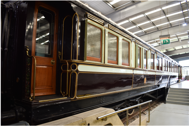
West Coast Joint Stock, 12 wheel RF, later Royal train