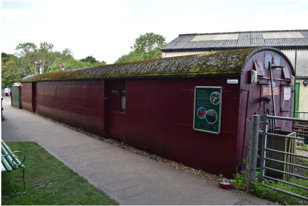
LSWR 74 'Ironclad' Third Corridor built 1923