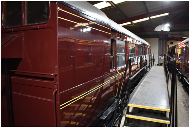
LYR 293 50' elliptical roof Dynamometer Car