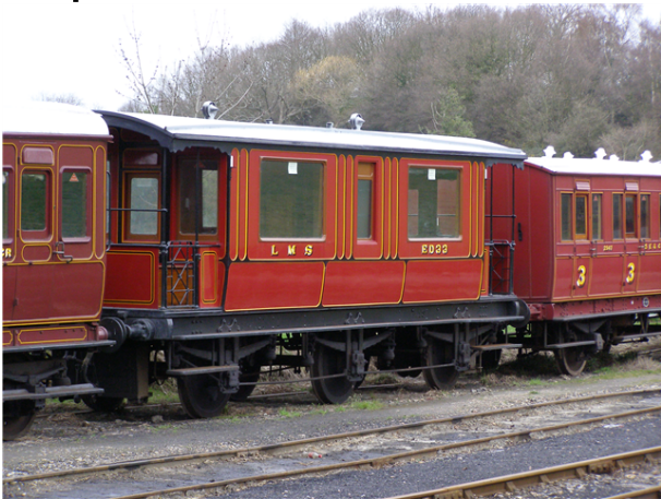
LNWR six-wheel inspection saloon