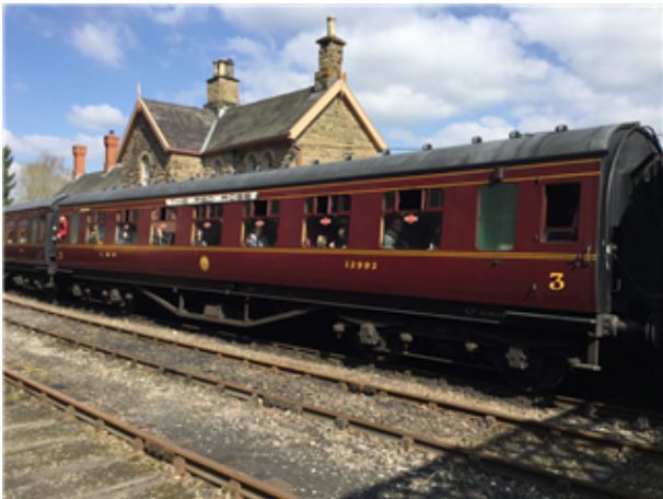
Stanier Bogie Corridor Third (TK) Period 3 (Diagram D2119)