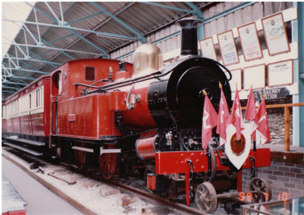
Port Erin Museum 10 Jul 1989